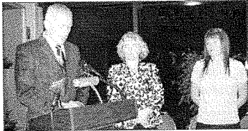
out, with the support of her husband's family to encourage people to think about what they are doing when they're driving.

"He must have figured, like many of us have over our driving lifetime, there's nothing coming so he went for it. Well, there was something coming, a dump-truck. It was killed instantly."