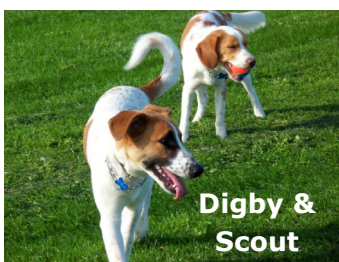
Digby & Scout