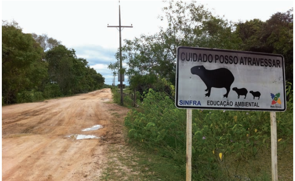
Sign warning motorists of giant rodents crossing the road