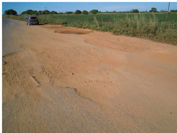
Brazilian potholes can swallow any car!