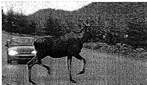
A moose runs in front of a car as it crosses the road in Gros Morne National Park in NL Tuesday, August 14, 2007.